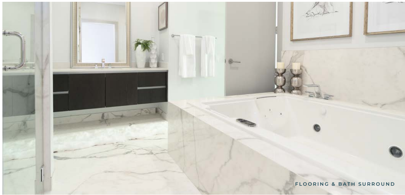
FLOORING & BATH SURROUND