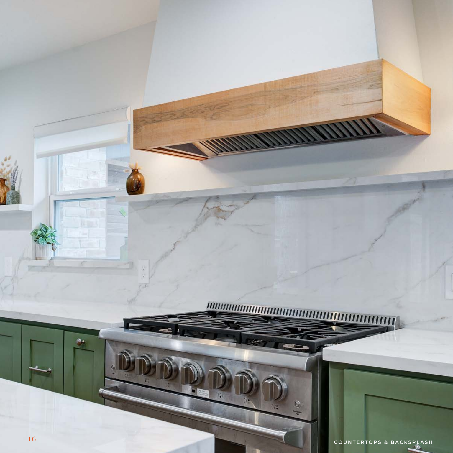
COUNTERTOPS & BACKSPLASH