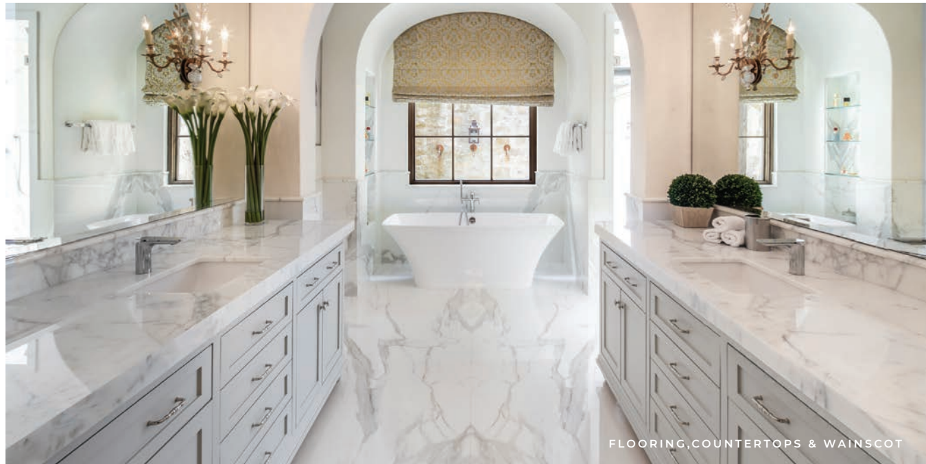
FLOORING, COUNTERTOPS & WAINSCOT