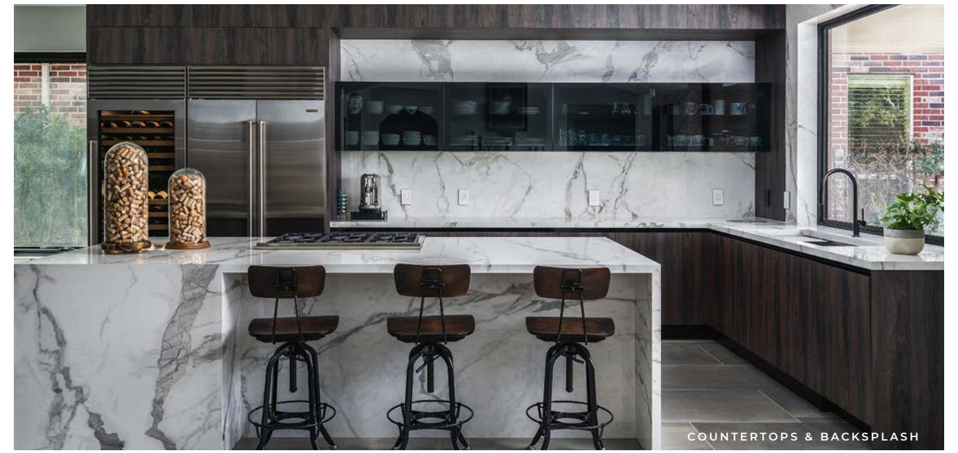
COUNTERTOPS & BACKSPLASH