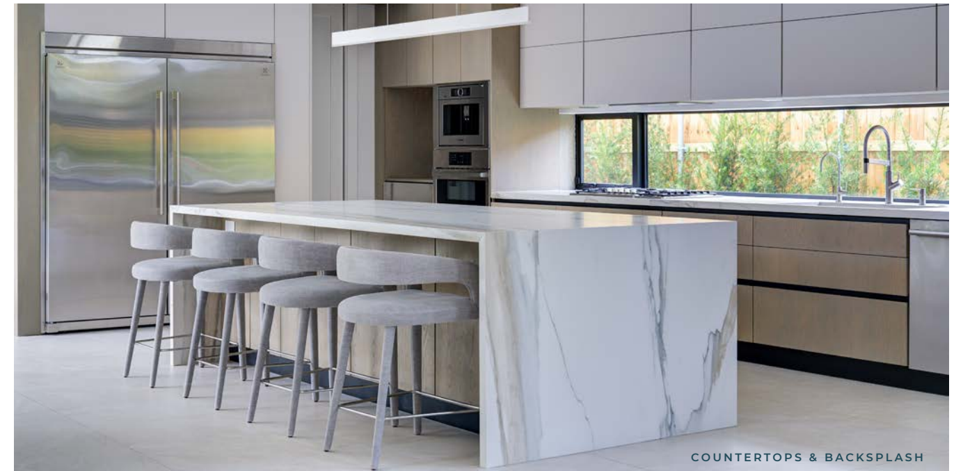
COUNTERTOPS & BACKSPLASH