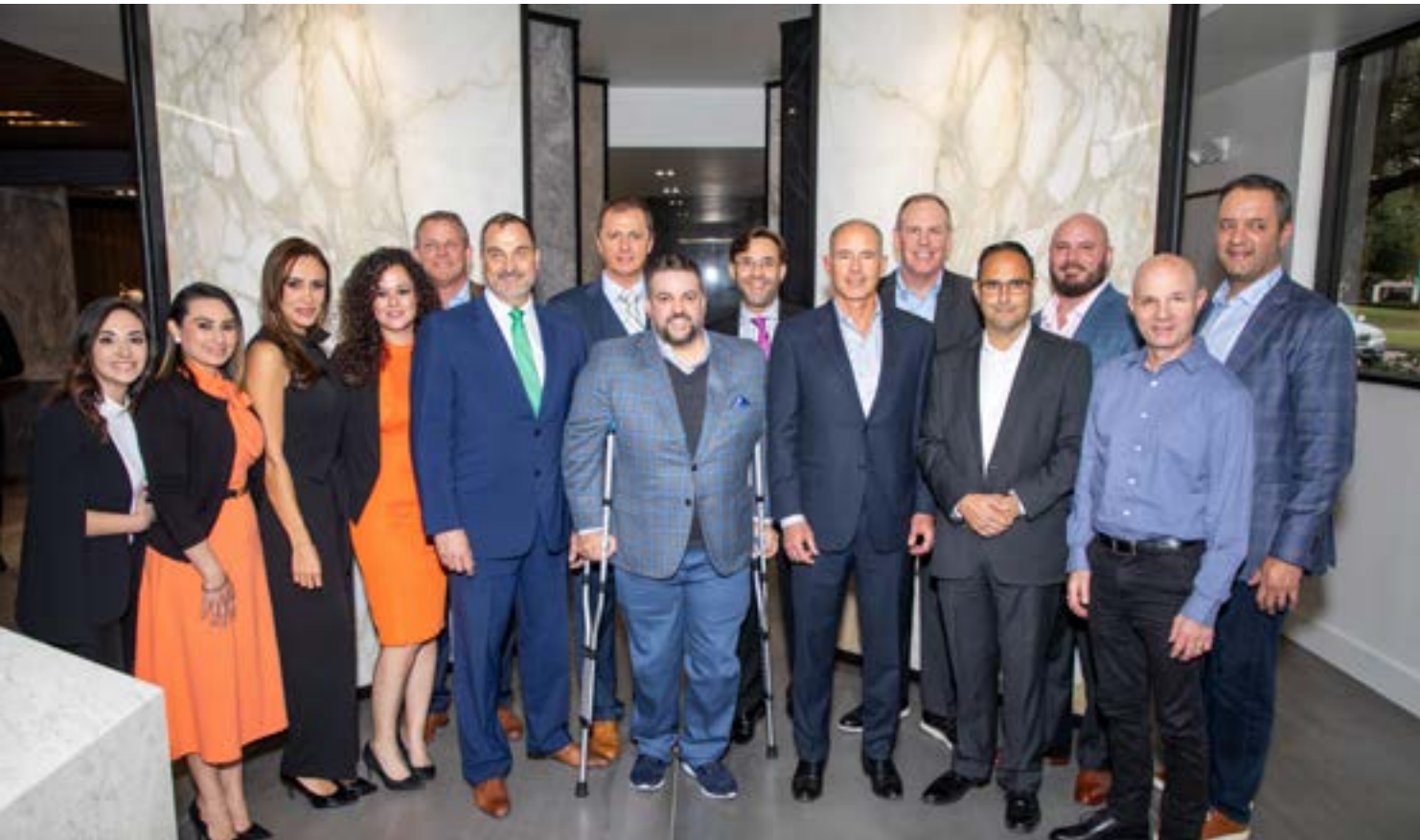
Founding Moderno Team members at Houston Grand Opening